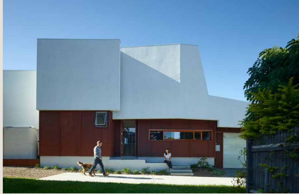
The distinct, folded planes of the Laneway House by O'Neill Architecture are beautifully amplified by the use of Taubmans Crisp White on the exterior. The clean, sophisticated hue highlights the entry port's sculptural blade, and the paint's satin finish serves as a textural counterbalance to the ground level's stained ply cladding.