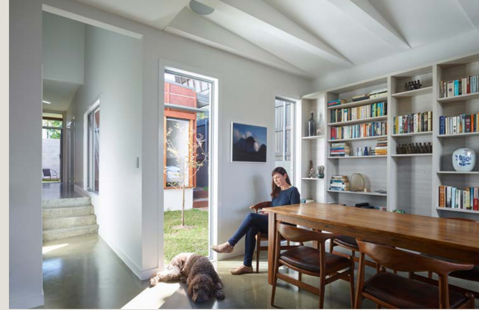
Taubmans Windy Beach, used predominantly on the interior walls and ceilings, complements the polished concrete floors and neutral joinery, and emphasizes the interior's deliberate lack of embellishment. In the main bedroom, a custom blend of Taubmans Stormboy with six drops of black evokes a relaxed, breezy atmosphere.

The exterior paint finish draws respectful attention to the home's distinct form and